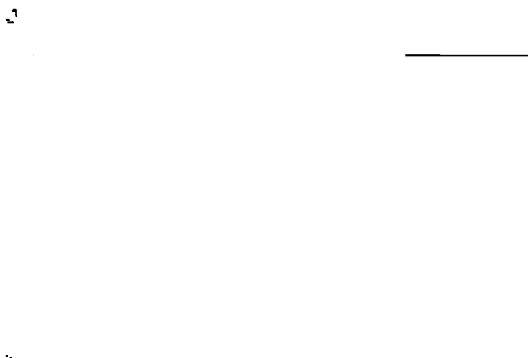
FIGURE 4 TOWEL REUSE RATES AS A FUNCTION OF SIGN IN ROOM (EXPERIMENT 2)

he or she will be to follow the norms of that category. That is, much of the extant literature suggests that participants' conservation behaviors should map onto the importance ratings. According to the importance ratings, participants should have been most likely to follow the norms of citizens or males/females and least likely to conform to the norms of hotel guests for the particular room in which the participants were staying. Yet, the data indicate that the appeal conveying the descriptive norm of those who had previously stayed in the guests' room yielded not the lowest compliance